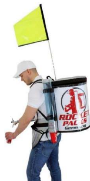
Promo-Flag with Pro 11-Liter