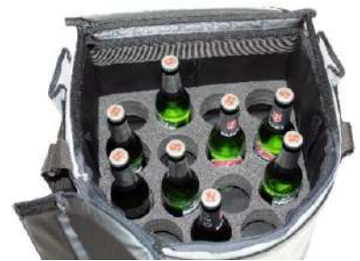
Hole Ø 70 mm, Height 50 mm