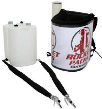
Illustration: Product features for non-carbonated beverages