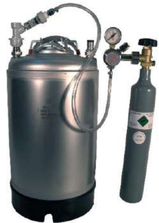
Item RP1102GN & Soda Club CO2-Cylinder attached to 11-liter container