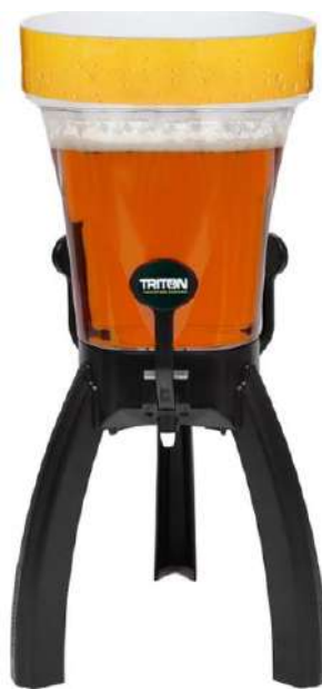
Classic 5 Liter