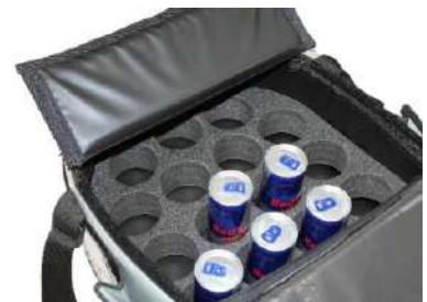
Hole Ø 70 mm, Height 50 mm