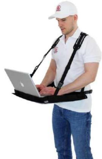
Belt System XL Model