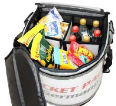
Inlay (room divider), keeps the Tray tidy