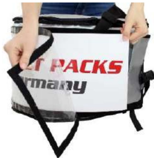
Flexible change of advertising messages