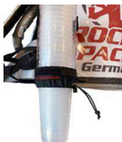
Universal Cup Dispenser for disposable & reusable cups