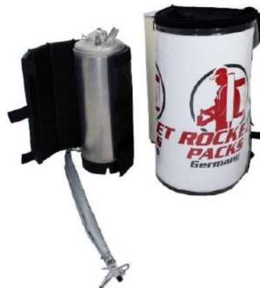
Illustration: Product features for non-carbonated beverages