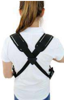
Ergonomic shoulder strap system with adjustable shoulder pad

Insulated Vendor’s Tray is suitable for a wide range of applications. High-quality materials and workmanship ensure stability and durability. Removable lift-up lid, shoulder belt system with adjustable shoulder pad in the back crosswise, ensure highest wearing comfort. With two side pockets outside for service accessories or money pouch. Front and lid (inside) can be decorated advertising purpose. When used the Tray with lid also suitable for distribution of ice cream products!