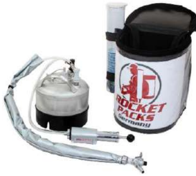
Hand operated Air Pump as pressure equipment