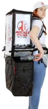
Twin-Pack incl. Waste Bag