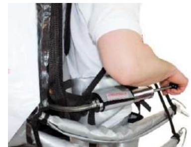
Hand operated Air Pump as pressure equipment