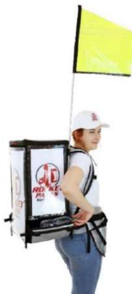
Promo-Flag with Twin-Pack