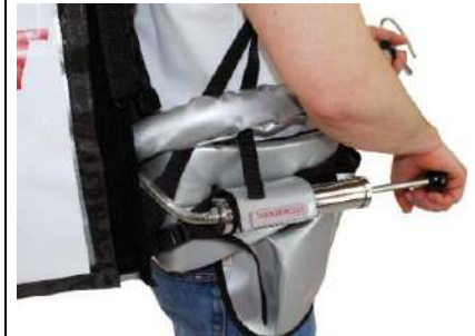
Pump connected to article Premium 11-Liter