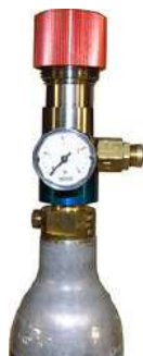
Item RP1102GN CO2-Regulator for Soda-Club bottle (Aluminum)