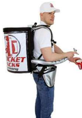
Pro 11-Liter, insures a professional brand appearance

Professional Beverage Backpack Insulation up to 4 hours