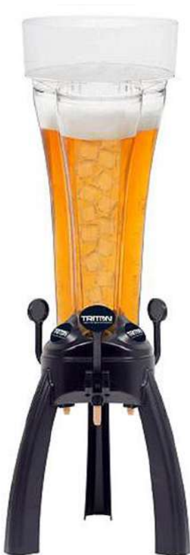
SKY 5 Liter incl. Ice Tube for ice cubes

The materials and raw materials used comply with Regulation (EU) No. 10/2011 and Regulation (EU) No. 1935/2004 and are suitable for use with food/beverages!