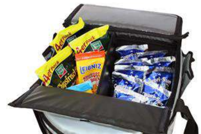
Inlay (room divider), keeps the Tray tidy