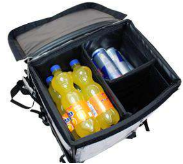
2 chamber device with loading capacity for 15 cans or bottles up to 500 ml each