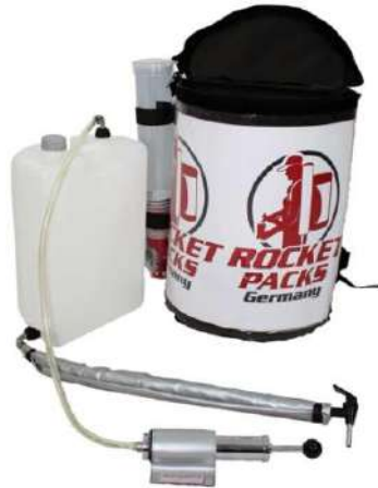
Illustration: Product features for non-carbonated beverages