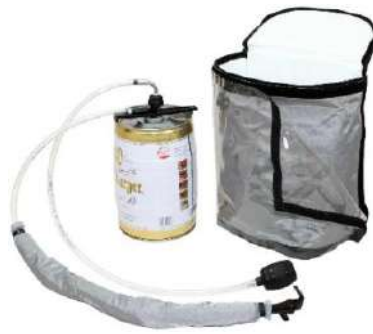
Scope of supply: Party-Pack for 5-liters ALU Beer Can