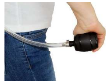
Operation with Mini-Air-Pump as pressure equipment