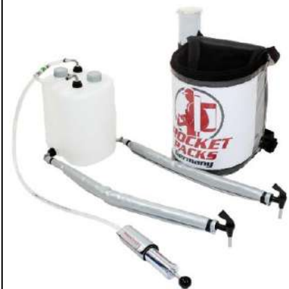
Illustration: Product features for carbonated beverages