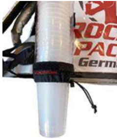
Universal Cup Dispenser for disposable & reusable cups

Beverage backpack with insulation (up to 2 hours). For serving two types of products from a backpack. Preferably suitable for cold drinks. Gravity-Fed operation of none-carbonated beverages, not need to use additional pressure equipment. Dispensing of carbonated beverages, additional pressure equipment has to be operated. The Mechanical Air Pump with T-Coupler is the most suitable method for this purpose. Ideal for fast beverage service!