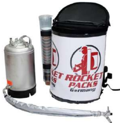
Illustration: Product features for non-carbonated beverages