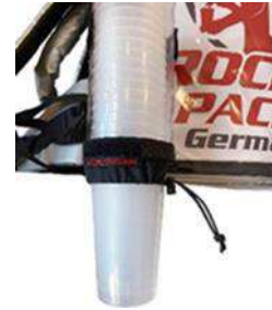
Universal Cup Dispenser for disposable & reusable cups