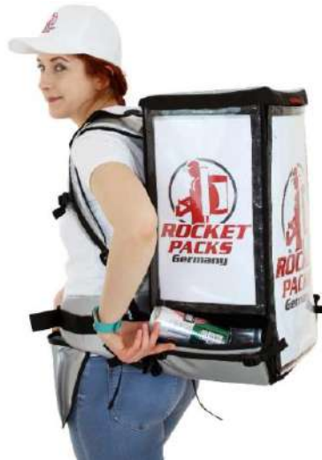
Flexible exchangeable advertising messages!