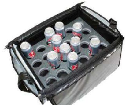
Hole Ø 70 mm, Height 50 mm