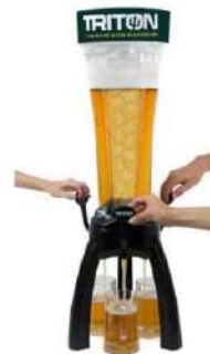
Multi-Tap System Three Dispensing Taps