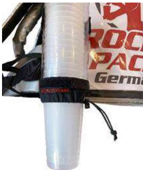
Universal Cup Dispenser for disposable & reusable cups