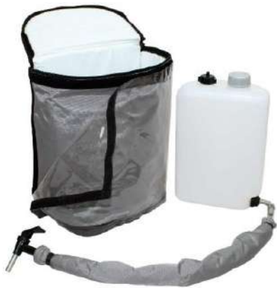
Illustration: Product features for none-carbonated beverages

Simple beverage backpack, with moderate insulation, suitable for any fun occasion. Preferably suitable for cold drinks. For still drinks, the emptying is working through Gravity-Fed - no additional pressure accessories required. When use the backpack with carbonated beverages, the Mini-Air-Pump has to be operated as pressure accessory.