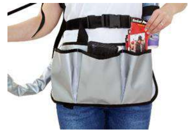
Vendor's Apron incl. 3 front bags