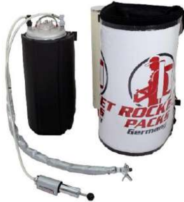
Illustration: Product features for carbonated beverages