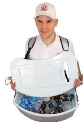
Sliding lid removeable