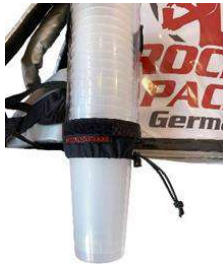
Universal Cup Dispenser for disposable & reusable cups