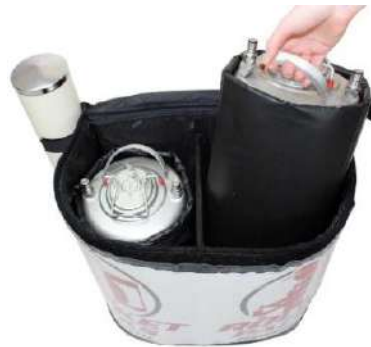
2 separately insulated beverage containers 11-liter