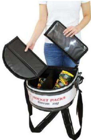
Lift-up lid completely removeable