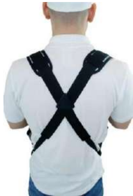
Ergonomic shoulder strap system with adjustable shoulder pad

Particularly suitable for use with 500 ml cans & bottles!