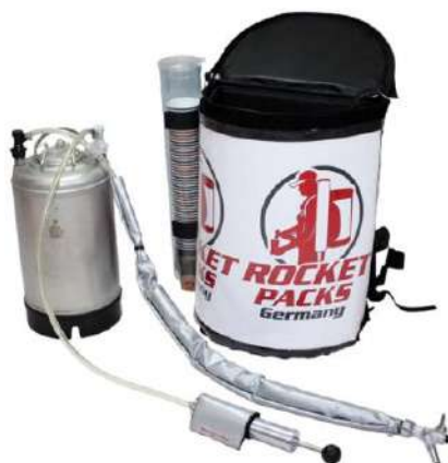
Illustration: Product features for carbonated beverages