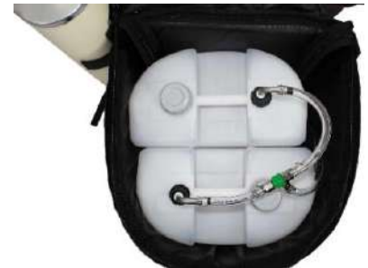
Pump with T-Connector attached to article Kombi 2x 15-Liter