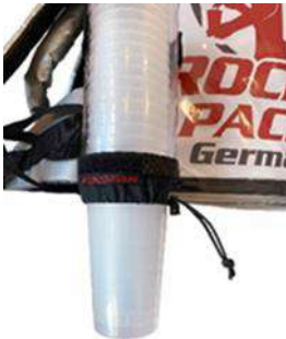
Universal Cup Dispenser for disposable & reusable cups