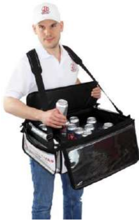
High capacity Vendor's Tray with insulation

High capacity Vendor's Tray, thermo-insulated, for a wide range of applications. High-quality materials and workmanship ensure stability and durability. Removable lift-up lid, shoulder belt system with adjustable shoulder pad in the back crosswise, ensure highest wearing comfort. With two side pockets outside for service accessories or money pouch. Front and lid (inside) can be decorated for advertising purposes. When use the Tray with lid also suitable for distribution of ice cream products!