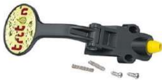
Tap with screws