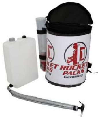
Illustration: Product features for non-carbonated beverages