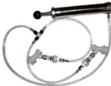
Air-Pump with T-Connector