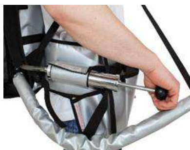
Hand operated Air Pump as pressure equipment *Further pressure accessories on request*