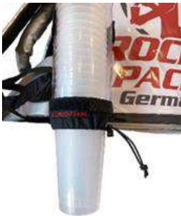
Universal Cup Dispenser for disposable & reusable cups