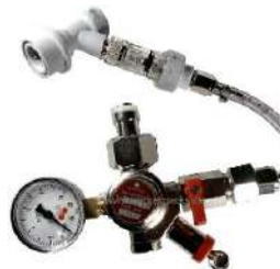
Item RP1102GN CO2-Regulator for Soda-Club bottle (Aluminum)