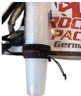
Universal Cup Dispenser for disposable & reusable cups