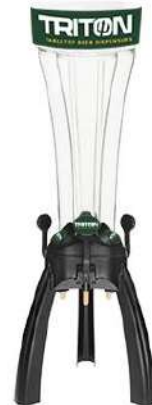
Cooling Block (optional)