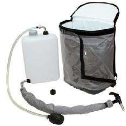
Illustration: Product features for carbonated beverages