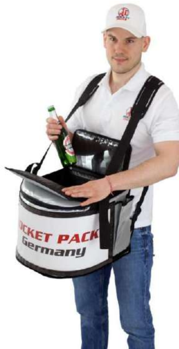
15-hole insert for stabilizing of cans, bottles and cups