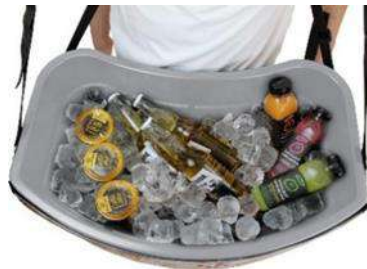
Illustration with 16-hole insert