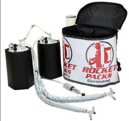
Illustration: Product features for carbonated beverages