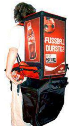
Pro 11 Liter incl. Waste Bag