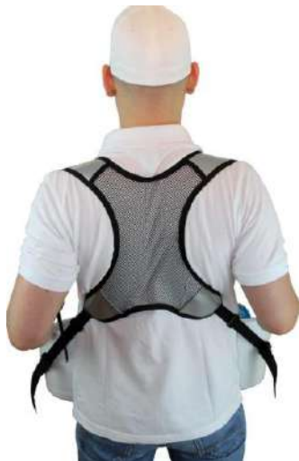
Ergonomical 4-point shoulder strap

Ideal for Ice-Cream and other frozen products!