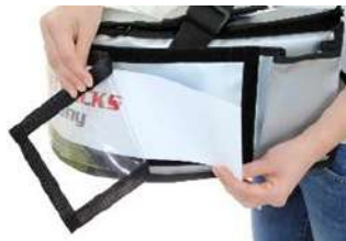
Flexible change of advertising messages