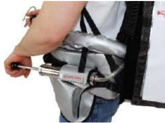
Hand operated Air Pump as pressure equipment *Further pressure accessories on request*

The XL-Variant of Mobile Beverage Service!