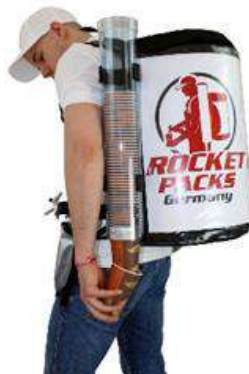
Cup Dispenser for cup sizes 100-550 ml