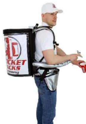
Pro 11-Liter, insures a professional brand appearance

Professional Beverage Backpack Insulation up to 4 hours