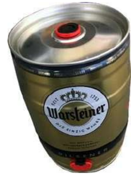
5-liters Beer Can