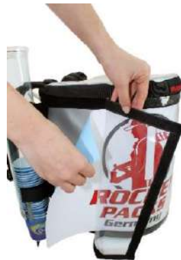
Flexible advertising decoration by paper insert behind foil