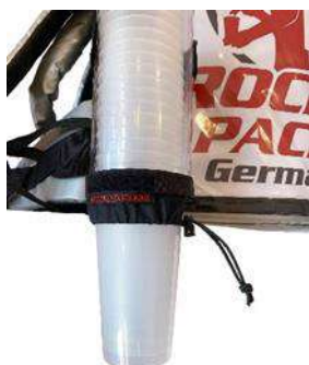
Universal Cup Dispenser for disposable & reusable cups