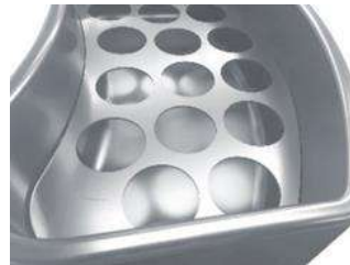
Illustration with two separators