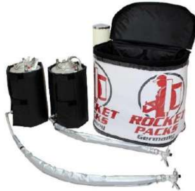
Illustration: Product features for non-carbonated beverages