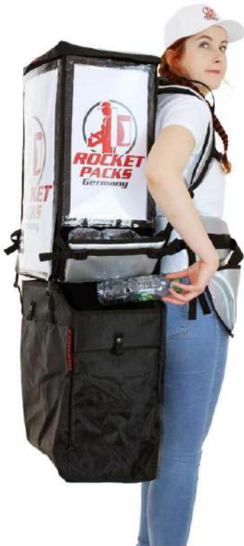
Twin Pack with waste bag for empties

The Twin Pack can be converted into a beverage backpack for serving in to cups. Just ask us for solutions and prices.