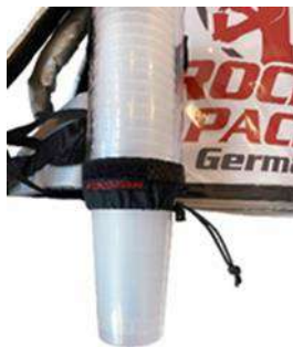
Universal Cup Dispenser for disposable & reusable cups