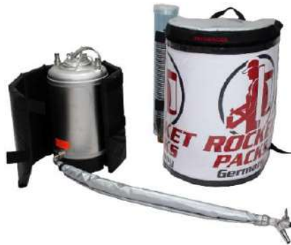
Illustration: Product features for non-carbonated beverages