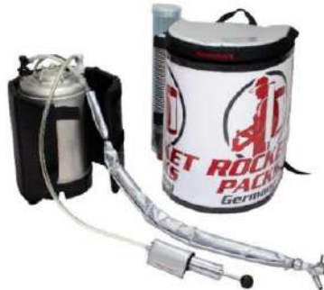
Illustration: Product features for carbonated beverages