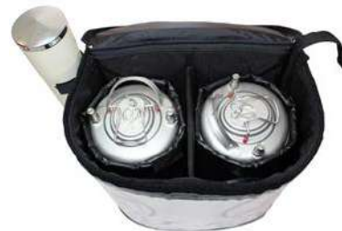
2 separately insulated beverage containers 11-liter