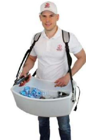
Ice-Cream-Tray excl. Foil-bag and sliding lid