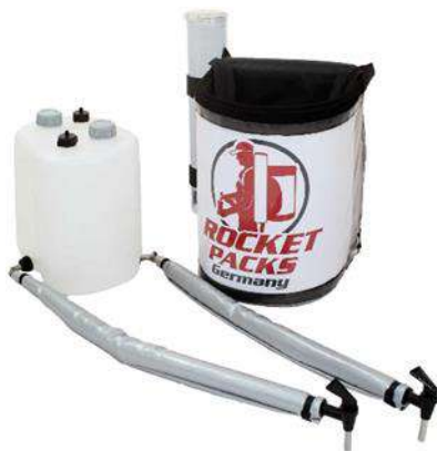
Illustration: Product features for none carbonated beverages