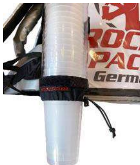
Universal Cup Dispenser for disposable & reusable cups