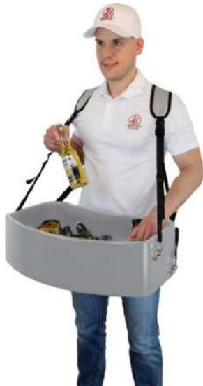
Illustration excl. Foil-Bag

- Flexible applicable Vendor Tray made of all-plastic -