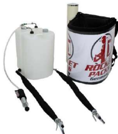
Illustration: Product features for carbonated beverages