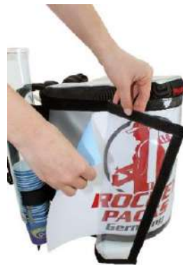
Flexible advertising decoration by paper prints behind foil