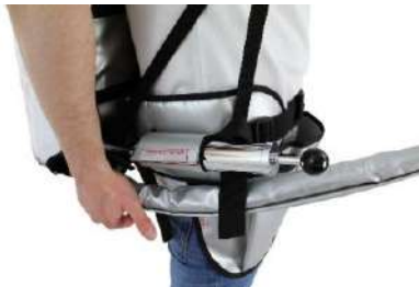
Hand operated Air Pump attached to backpack harness