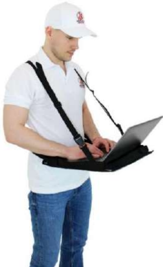
Belt System Standard Model